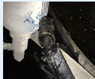
Melted hydraulic line

At the mine a hydraulic power pack used for a belt take up underground overheated, due to an electronic solenoid that was stuck open, causing the hydraulic pump, valving controls and hydraulic fluid to overheat. As a result the hydraulic line melted and sprayed hydraulic fluid everywhere. Because the mine was using QUINTOLUBRIC® 888-68 fire-resistant hydraulic fluid a fire did not erupt.